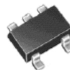
SOT23-5L -40°C ~ 85°C

The CP2126 is a step-up DC/DC converter specifically designed to drive white LEDs with a constant current. The device can drive two, three or four white LEDs in series from a Li-Ion cell. Series connection of LEDs provides identical LED currents resulting in uniform brightness. The CP2126 switches at 900KHz, allowing the use of tiny components. The external capacitor can be as small as 0.22uF, saving space and cost versus alternative solutions. A low 95mV feedback voltage minimizes power loss in the current setting resistor for better efficiency.